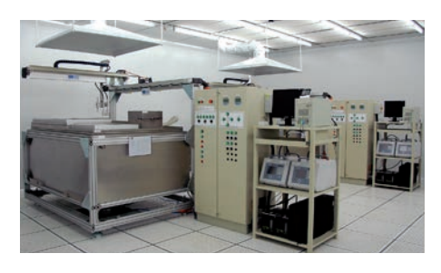
AAF laser spectrometer.

The filter is tested with a laser spectrometer using polystyrene latex (PSL) spheres. Filter efficiency is determined by comparing the upstream and downstream concentrations. Efficiencies down to 0.10 micrometers can be determined.