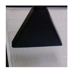
Scanning with light scattering photometer.