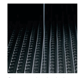
Scan test showing leak indicated by a smoke trail.

For pharmaceutical and those applications requiring PAO, AAF offers scanning with this material using a light scattering photometer.