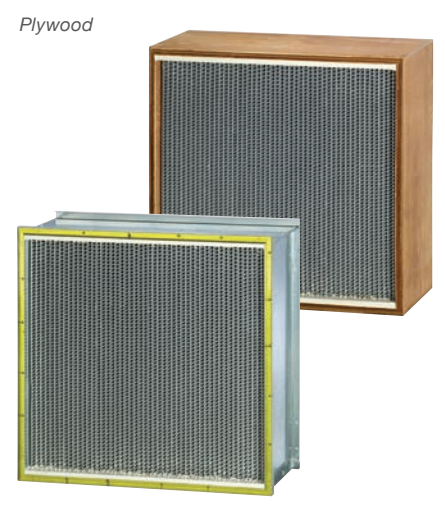
Gel Seal Metal Construction